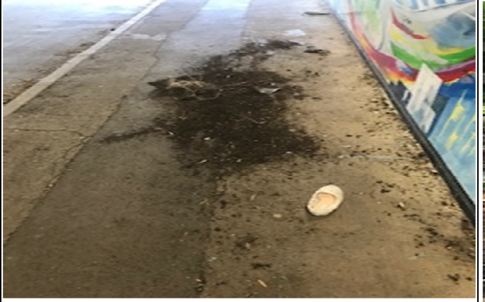
Green waste fly tipped in the subway at Magpie Walk