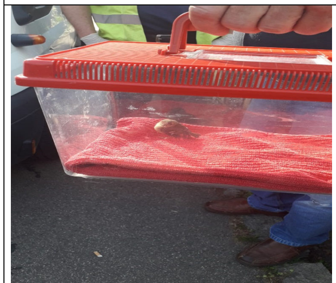
A baby bird that we managed to rescue in Zone 5. We managed to contact a veterinary ambulance who came to pick it up and we're told is now doing really well