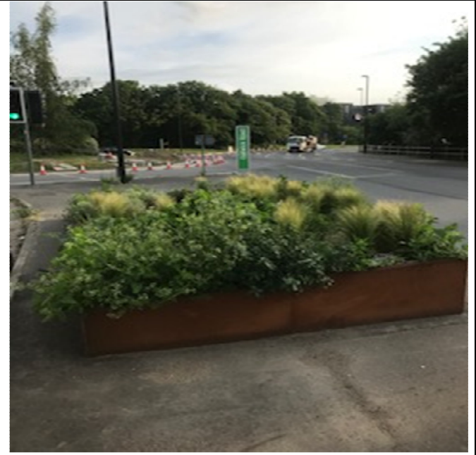
Another before and after of a planter at Gateway 1