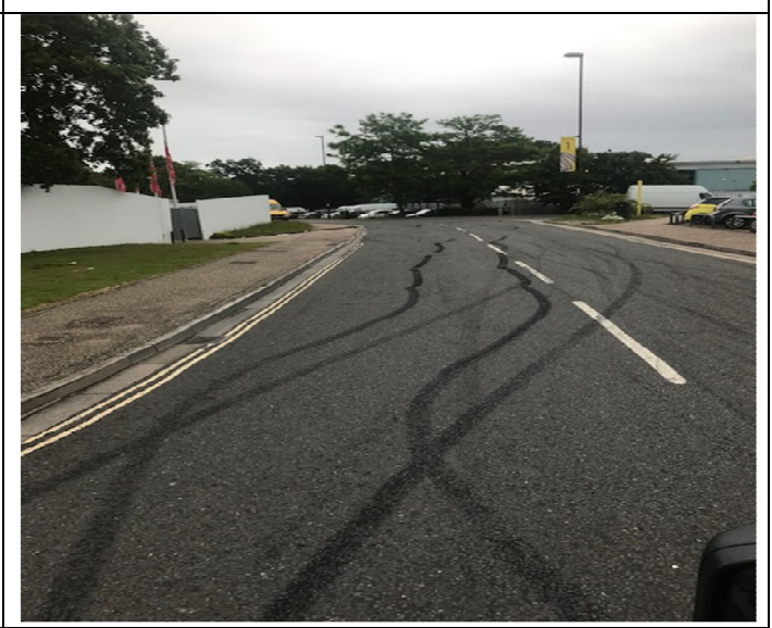
Tyre marks left from car cruisers Zone 1