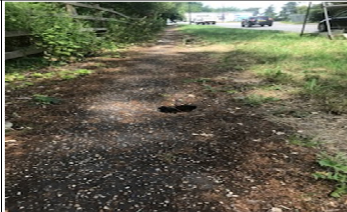
A pothole we discovered a long Gatwick Road and have reported to West Sussex