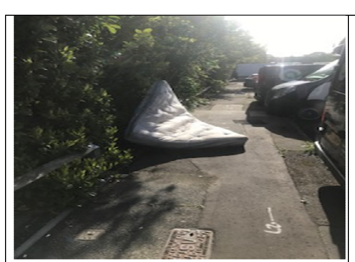
A mattress fly tipped a long Kelvin Lane