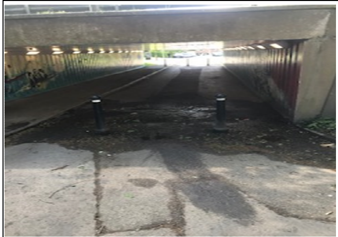
Before and after of the subway at Woolborough lane. We noticed it was leaking and reported to West Sussex