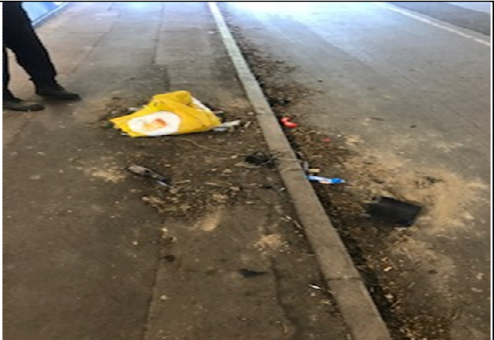
Green waste fly tipped in the subway at Magpie Walk